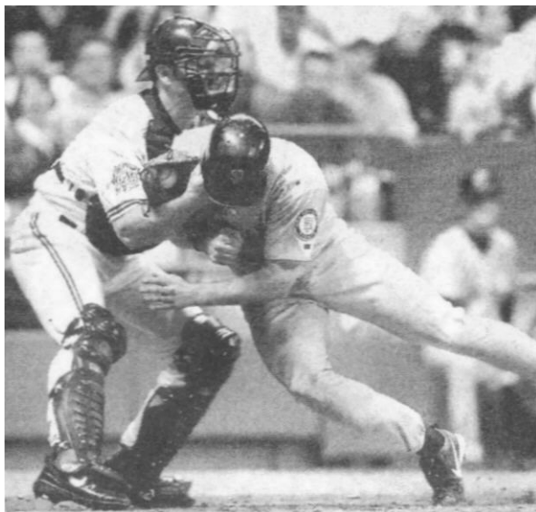
FIGURE 1. Possession

Not a whole lot of interpretation involved with Figure 1 . The catcher clearly is in full possession of the ball and the runner's intent is pretty obvious. Although this is "good, hard professional baseball," it is definitely a violation of the NWIBL No Collision Rule. If you ever witness this play, and regardless of whether the catcher (or any defensive player) was able to hold onto the ball, the runner should be called out and, in this case, ejected from the ball game. A "no-brainer" for any umpire.